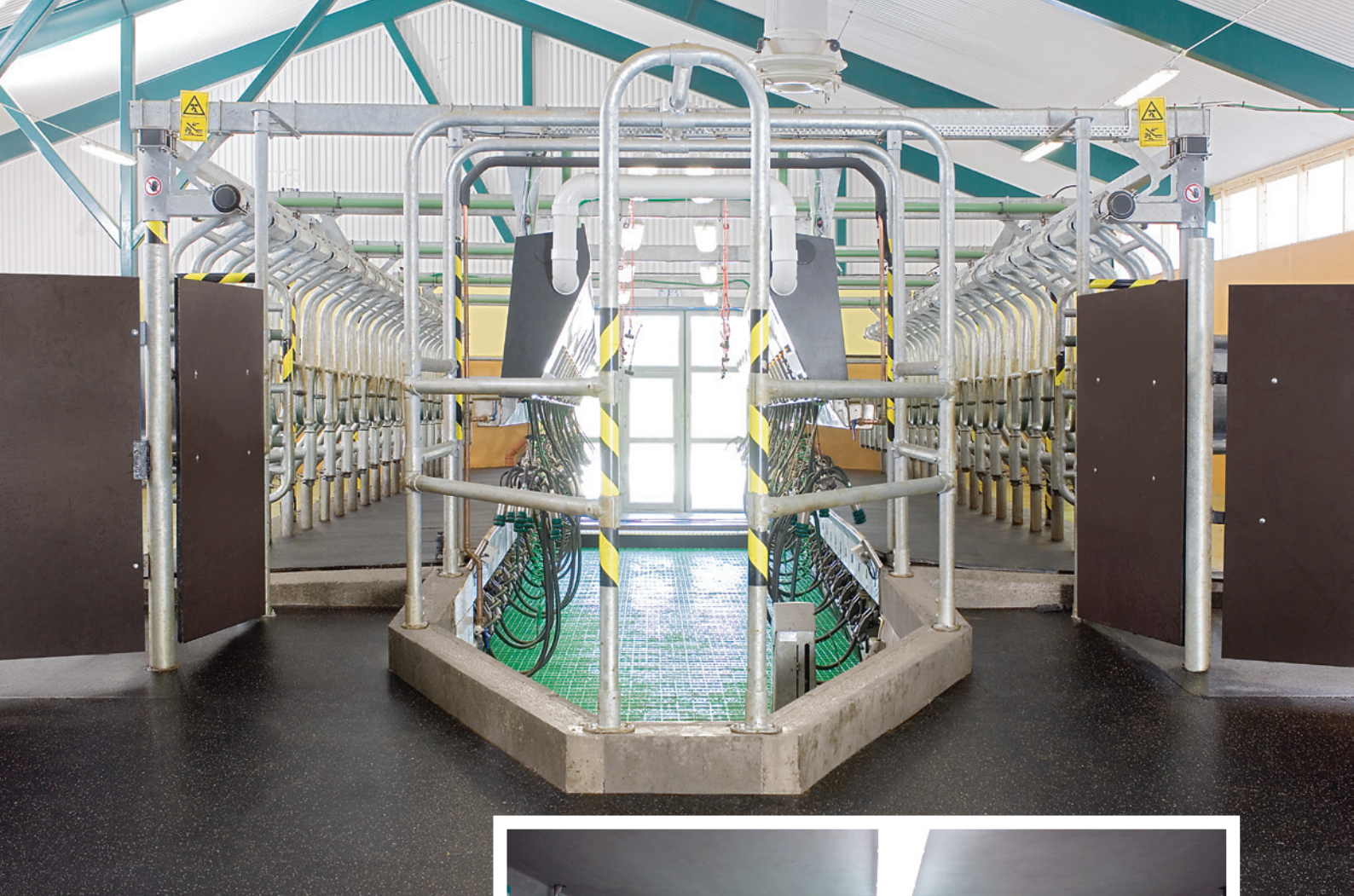
Model: Global 90i without subway